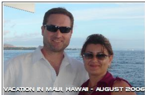
VACATION IN MAUI, HAWAII - AUGUST 2006